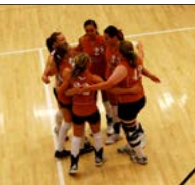
home match against Satanta.