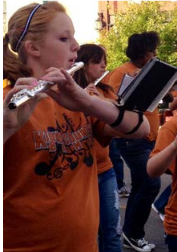
RIGHT: Band students march down the streets of Hutchinson eagerly awaiting their arrival to the State Fair.

Overall, the band state fair day was a success to all and the students did indeed fill their unhealthy cravings.