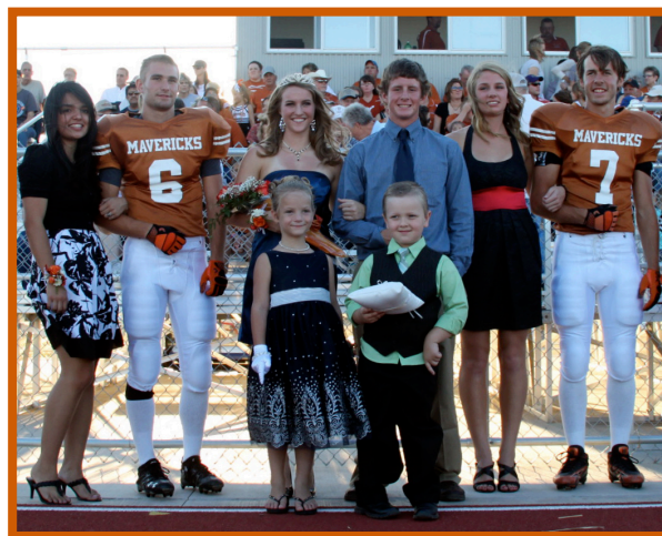
The 2010 Fall Homecoming Candidates and king and queen pose after the big announcement for parents and family.

chosen by Student Council representatives.